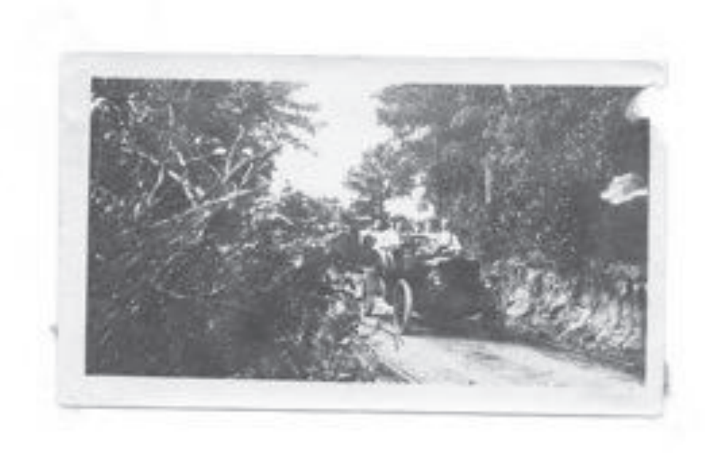
PETTUS RD NEAR MT. CARMEL JOLY, 09